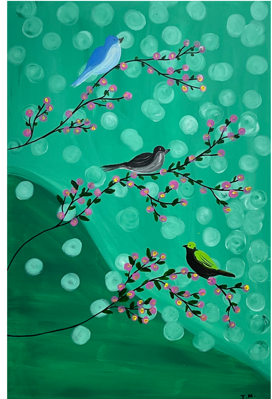
Musical Vibes Acrylic on canvas 120 x 80 cm